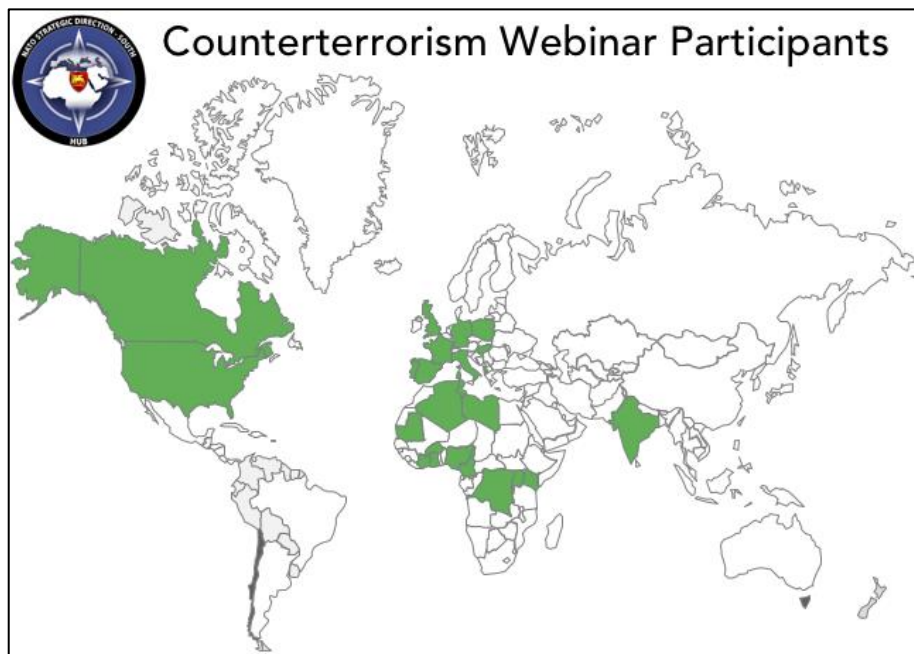
Figure 1: Countries represented by webinar participants